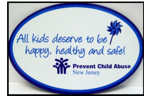
Car Magnets $10