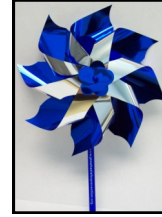
Pinwheels 48 for $20