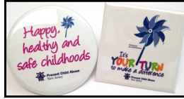
Buttons 10 for $5

Visit preventchildabuse.nj.org to download FREE tip sheets, talking points, activity pages, & multimedia tools to support your campaign.