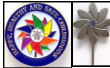
Lapel Pins $5