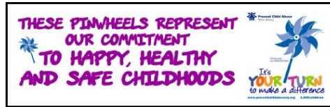
24" Garden Sign $10