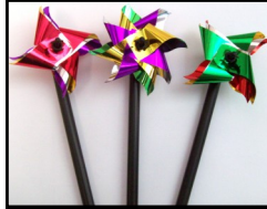
Mini 4" Pinwheels 72 for $25