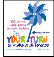
5' Window Cling $10 12' Window Cling $15