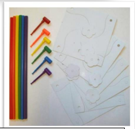
Make Your Own Pinwheel Kit