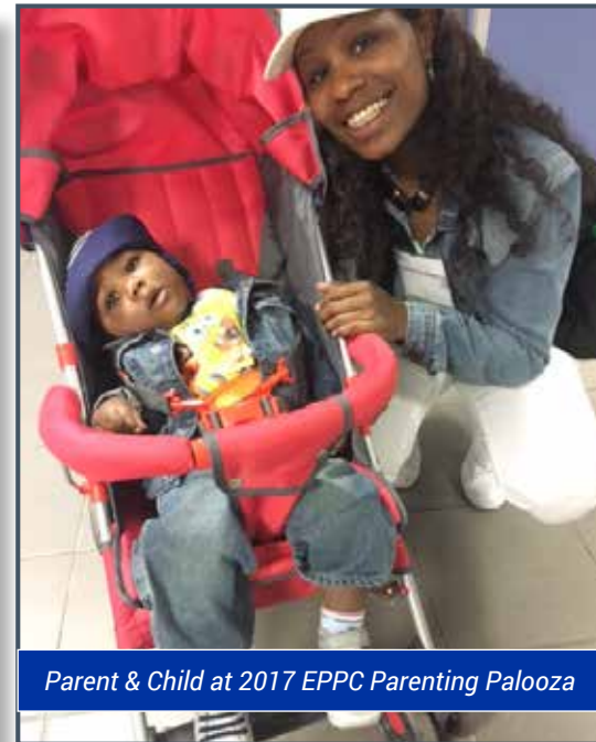
Parent & Child at 2017 EPPC Parenting Palooza