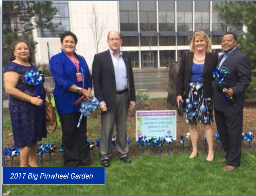
2017 Big Pinwheel Garden