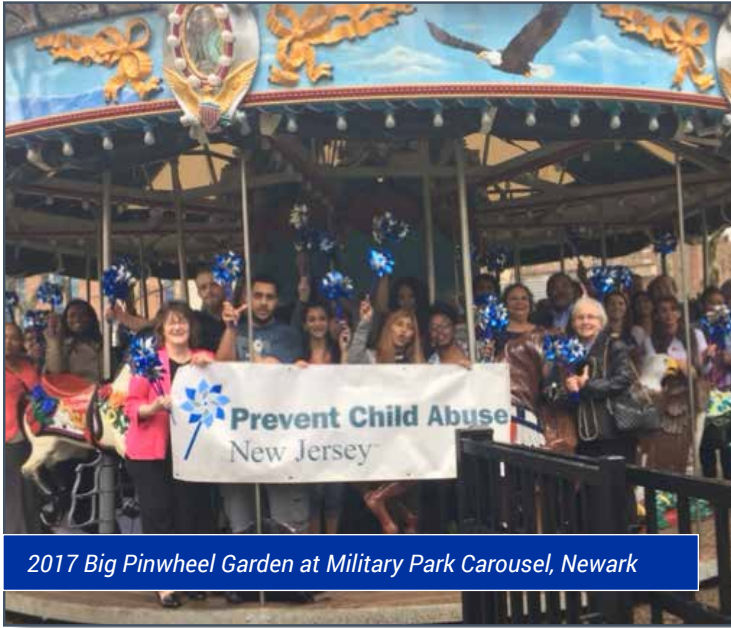
2017 Big Pinwheel Garden at Military Park Carousel, Newark