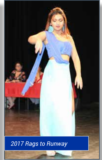
2017 Rags to Runway