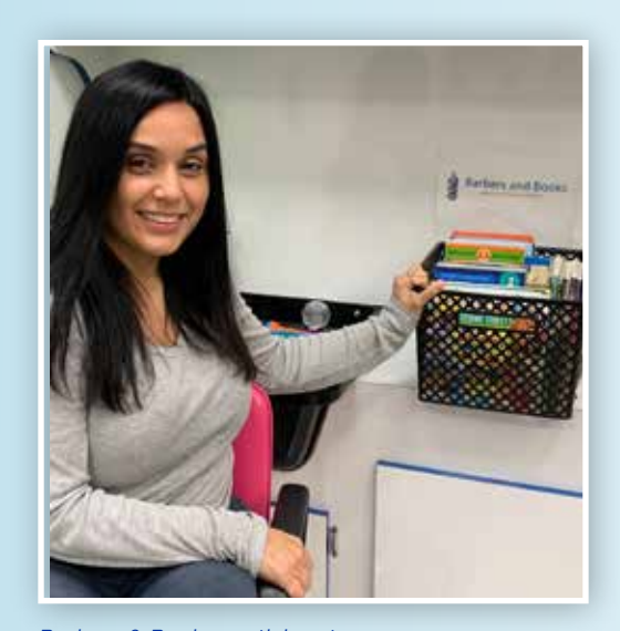
Barbers & Books participant