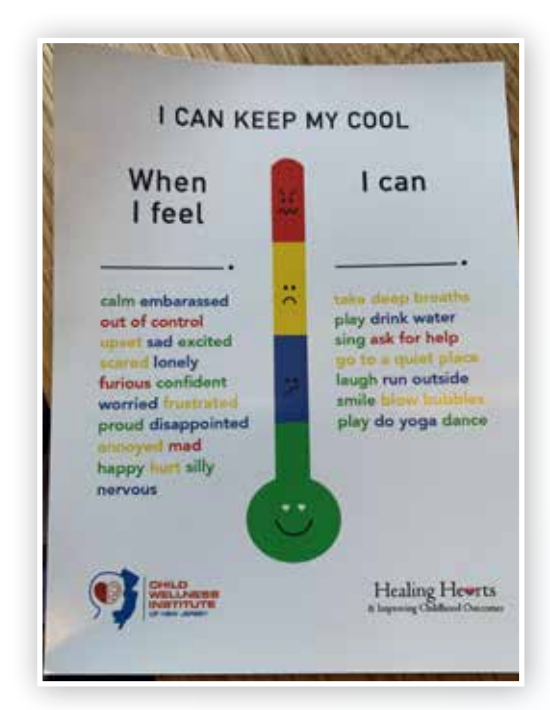
Feelings Thermometer – Keeping My Cool