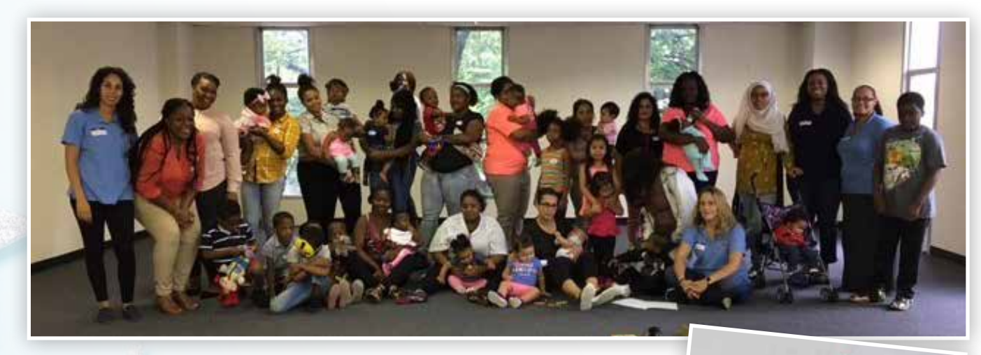
Books Balls & Blocks attendees