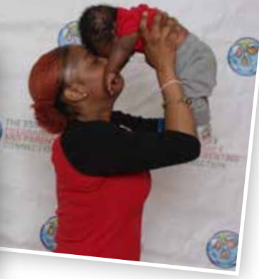
Mother and Child at Parenting Palooza