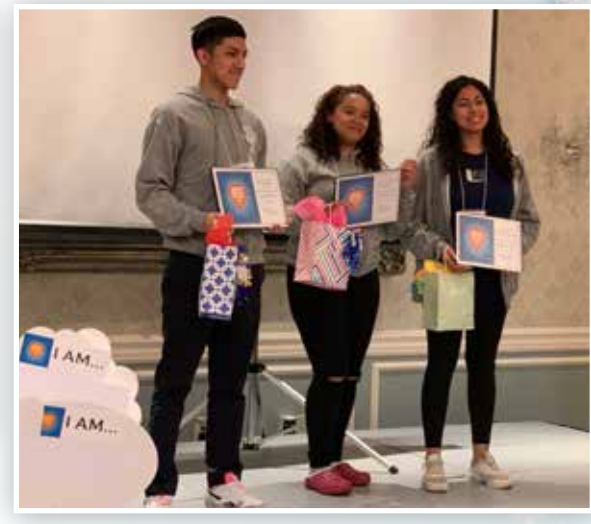
Student winners of "parenting superhero" video contest