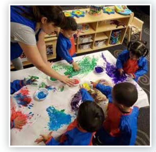
Teacher interacting with students at Le Petit Jardin