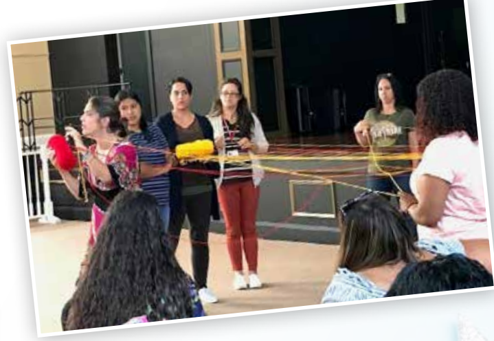
Building a Healthy (Yarn) Brain during training